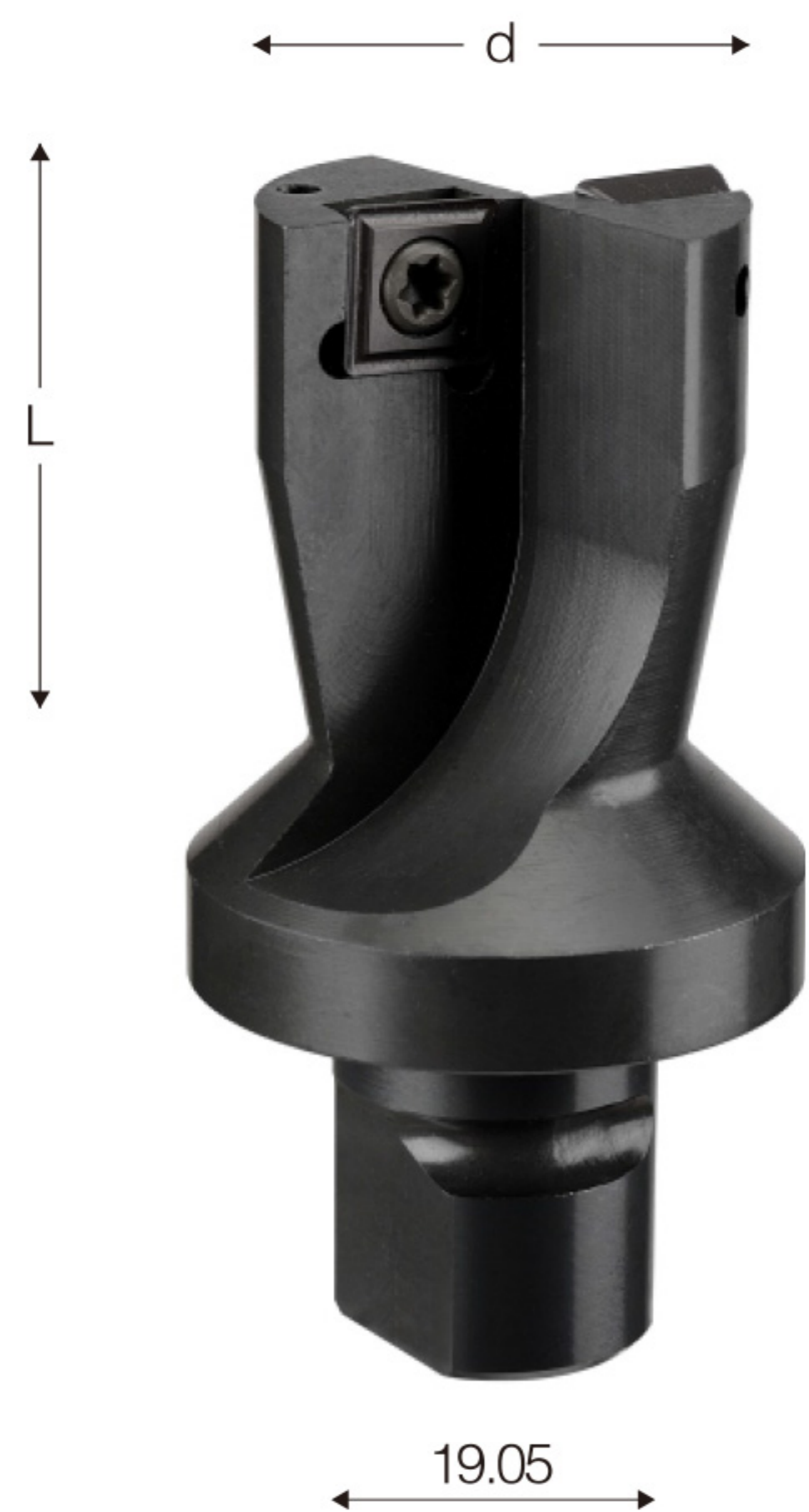
d:直径 d: Diameter L: 钻孔的深度 L: Cutting depth