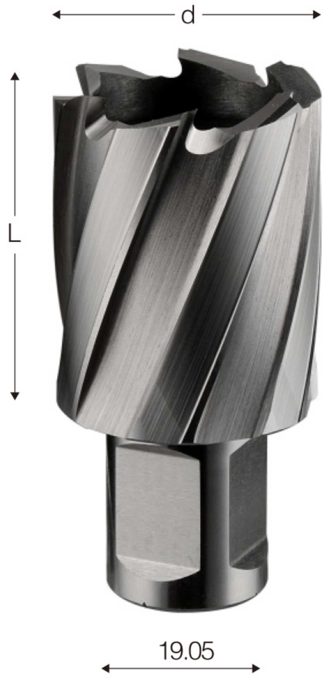
d:直径 d: Diameter L: 钻孔的深度 L: Cutting depth