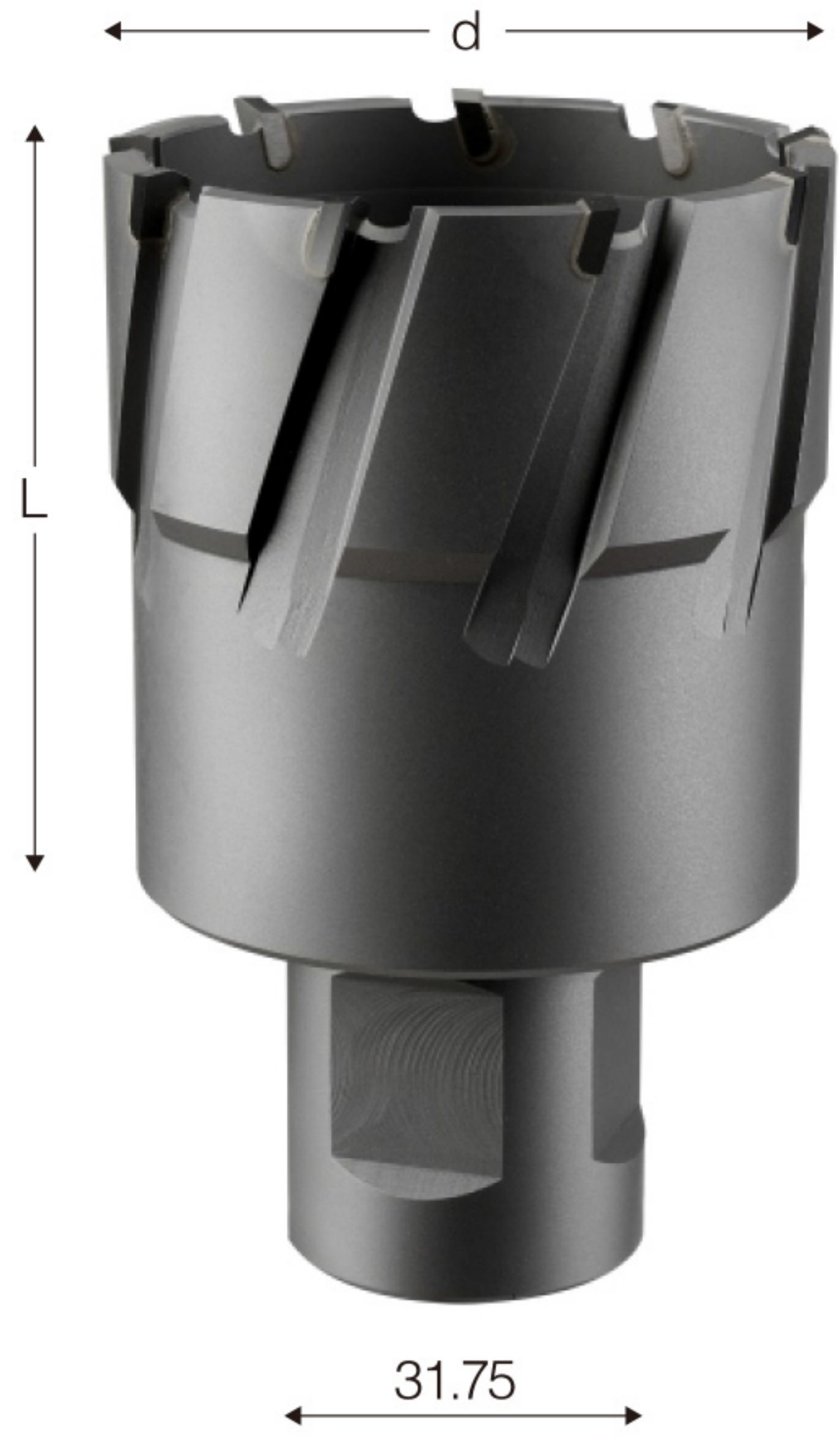
d:直径 d: Diameter L: 钻孔的深度 L: Cutting depth